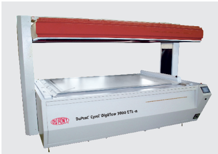
DuPont™ Cyrel® DigiFlow 3000 ETL