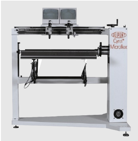
DuPont™ Cyrel® Microflex 850