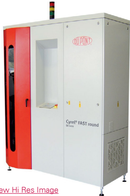
View Hi Res Image