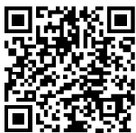
Download latest version

DuPont Packaging Graphics continues to be a global technology leader in the development and supply of flexographic printing systems. Our R&D team continues to develop innovative new solutions to help our customers expand their business by taking advantage of new and profitable opportunities in the growing flexographic packaging market. The DuPont Packaging Graphics portfolio of products includes DuPont™ Cyrel® brand photopolymer plates ( analogue and digital ), Cyrel® platemaking equipment, Cyrel® round sleeves , Cyrel® plate mounting systems and the revolutionary Cyrel® FAST thermal system .