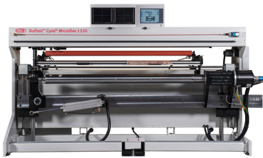
DuPont™ Cyrel® Microflex 1320

DuPont Advanced Printing brings together leading technologies and products for the printing and package printing industries. DuPont™ Cyrel® is one of the world's leading flexographic platemaking systems in digital and conventional formats, including DuPont™ Cyrel® brand photopolymer plates ( analogue and digital ), Cyrel® platemaking equipment , Cyrel® round sleeves , Cyrel® plate mounting systems and the revolutionary Cyrel® FAST thermal system .